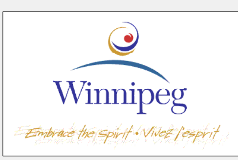
City Centre Detail View