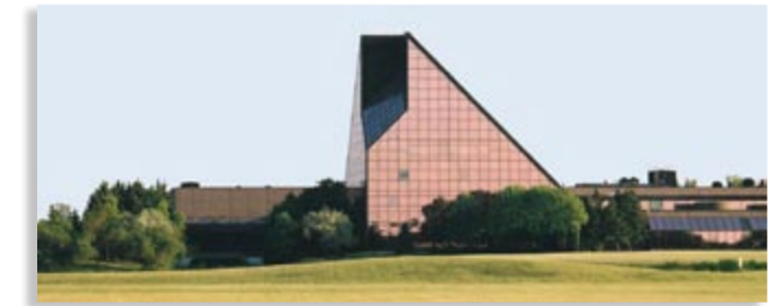
The Royal Canadian Mint, Lagimodière Boulevard at Fermor Avenue