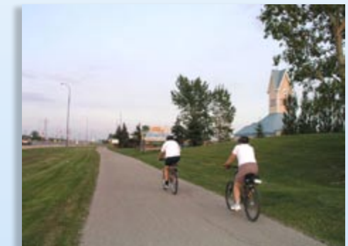
Cyclists enjoying the trail alongside the community of Island Lakes