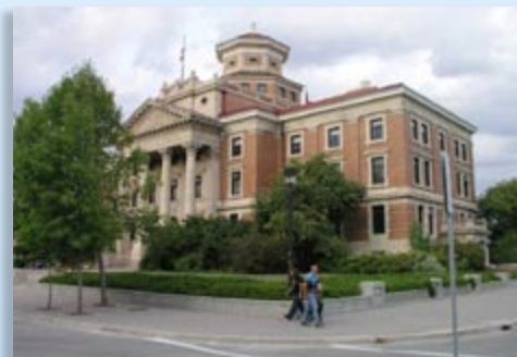
Administration Building, Chancellor's Circle, University of Manitoba