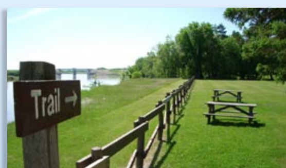
St. Norbert Provincial Heritage Park