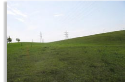
Rolling topography along the Greenway