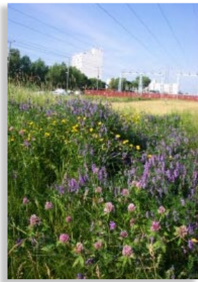
Wildflowers growing along the corridor