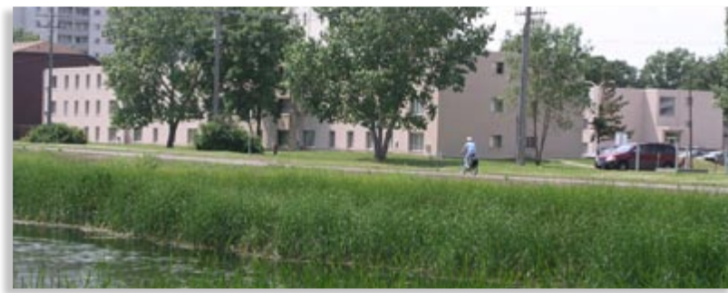
Marshes along the Greenway help users to appreciate the biodiversity of the corridor