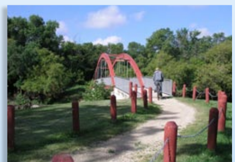
La Barriere Park