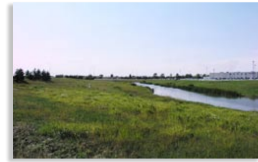
Wetlands along the Greenway attract a variety of birds