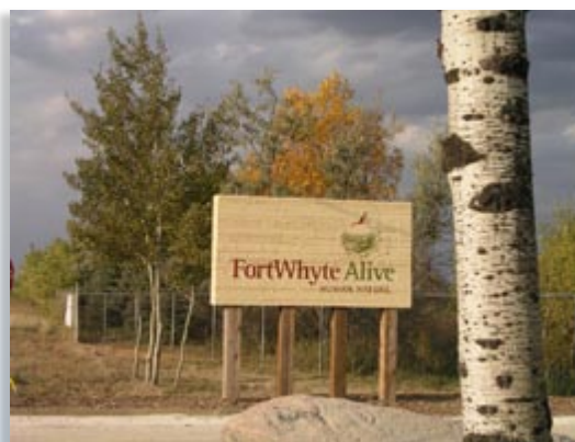
FortWhyte Alive is a nature reserve built upon a reclaimed industrial site within Winnipeg's city limits