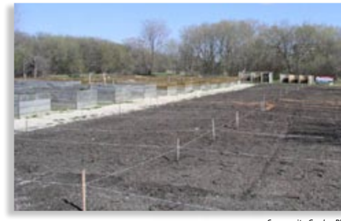
Community Garden Plots