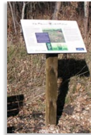
Trans Canada Trail Interpretive Panel