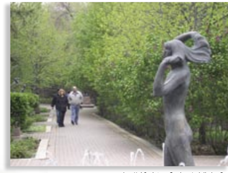
Leo Mol Sculpture Garden, Assiniboine Park

Assiniboine Forest To Harte Trail To Sterling Lyon Parkway