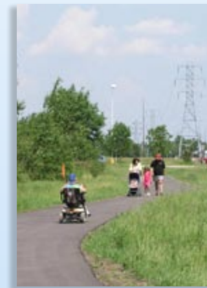
An accessible route through the Greenway